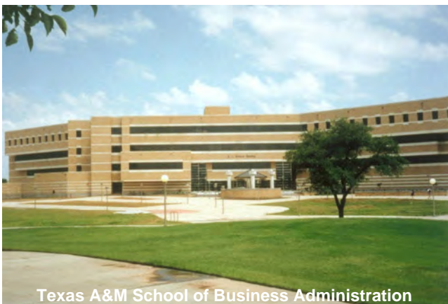
Texas A&M School of Business Administration

Texas A&M University Data Center, College Station, TX