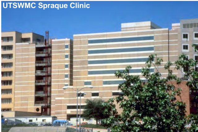
UTSWMC Sprague Clinic