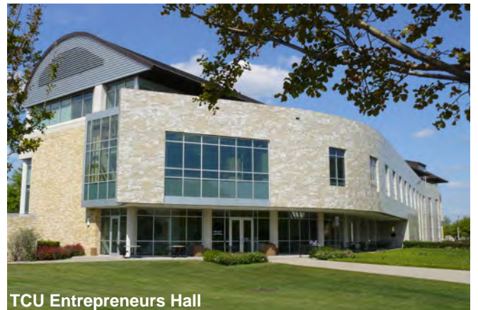
TCU Entrepreneurs Hall