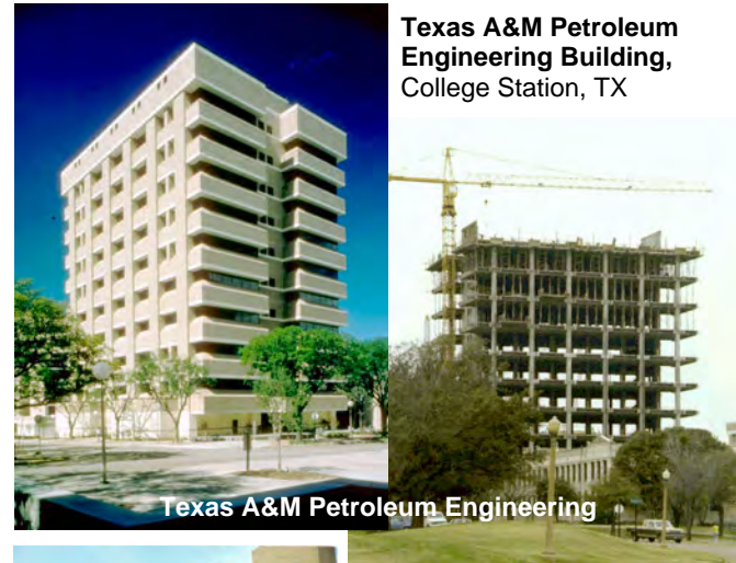
Texas A&M Petroleum Engineering Building, College Station, TX