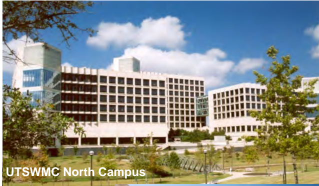
UTSWMC North Campus

Texas A&M Bio-Chemistry/Bio-Physics Building, College Station, TX