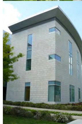
TCU Entrepreneurs Hall, TCU, Fort Worth, TX