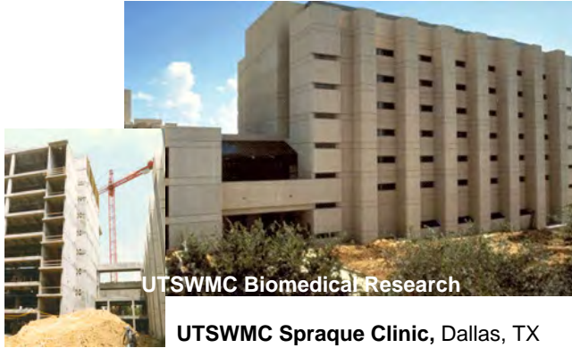
UTSWMC Biomedical Research