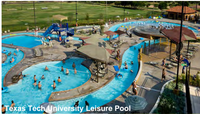
Texas Tech University Leisure Pool

Texas Tech University Leisure Pool , Texas Tech University, Lubbock, TX • $4,400,000.00 project cost