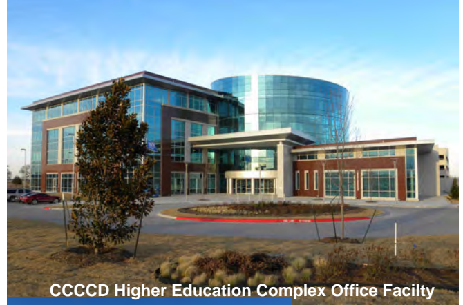
CCCCD Higher Education Complex Office Facility

CCCCD Higher Education Complex Office Facility , Collin County Community College District, Collin County, TX • $16,500,000.00 project cost