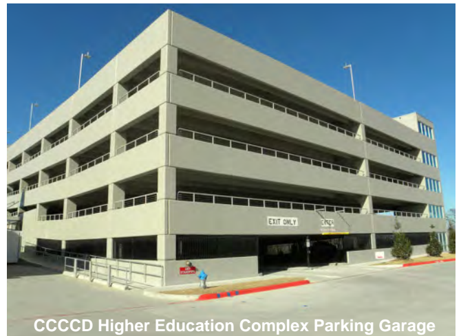
CCCCD Higher Education Complex Parking Garage

CCCCD Higher Education Complex Parking Garage , Collin County Community College District, Collin County, TX • $7,000,000.00 project cost