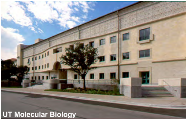
UT Molecular Biology