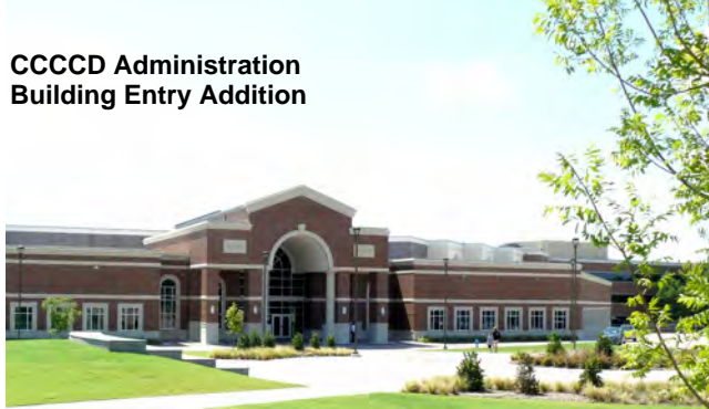
CCCCD Administration Building Entry Addition

CCCCD Administration Building Entry Addition , Collin County Community College District, Collin County, TX • $3,000,000.00 project cost