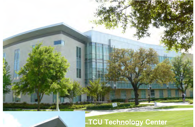
TCU Technology Center