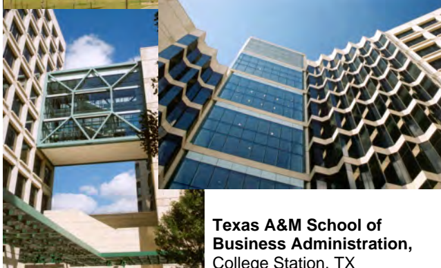
Texas A&M School of Business Administration, College Station, TX