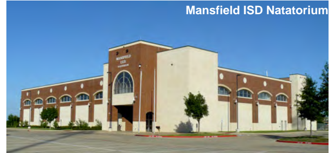
Mansfield ISD Natatorium