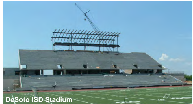
DeSoto ISD Stadium

DeSoto ISD Stadium , DeSoto ISD, DeSoto, TX • $9,200,000.00 project cost