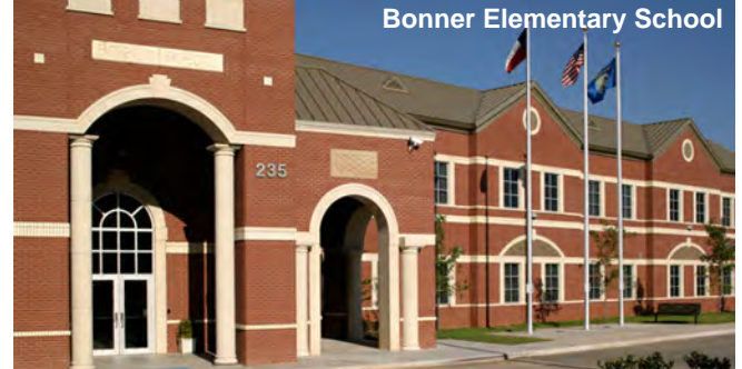
Bonner Elementary School

Bonner Elementary School , Tyler ISD, Tyler, TX • $10,454,937.00 project cost