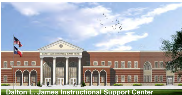
Dalton L. James Instructional Support Center

Dalton L. James Instructional Support Center , DeSoto ISD, DeSoto, TX • $7,500,000.00 project cost