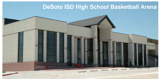
DeSoto ISD High School Basketball Arena

DeSoto ISD High School Basketball Arena , DeSoto ISD, DeSoto, TX • $10,000,000.00 project cost