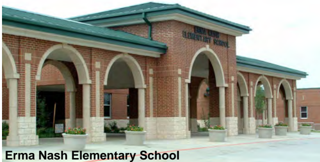
Erma Nash Elementary School

Elizabeth Smith Elementary School , Mansfield ISD, Mansfield, TX