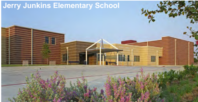
Jerry Junkins Elementary School

Kennedy Curry Middle School Renovation , Dallas ISD, Dallas, TX