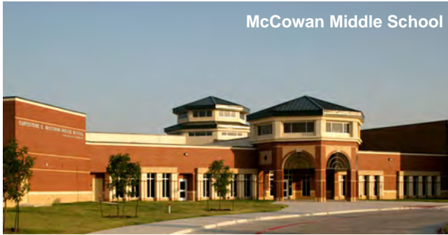
McCowan Middle School

McCowan Middle School , DeSoto ISD, DeSoto TX • $21,000,000.00 project cost