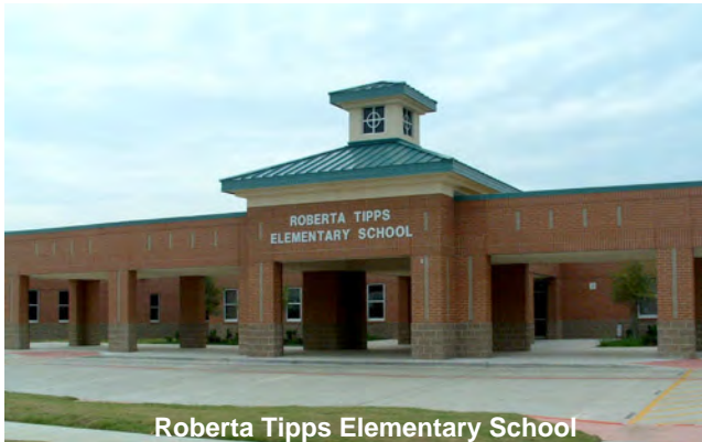
Roberta Tipps Elementary School

Mansfield Erma Nash Elementary School , Mansfield ISD, Mansfield, TX