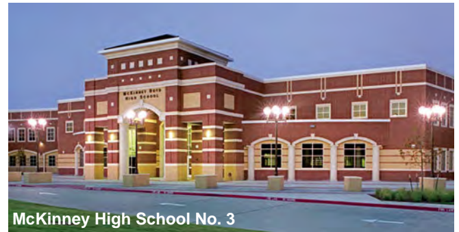
McKinney High School No. 3

Boyd High School - Phase 2B , McKinney ISD, McKinney, TX • $39,000,000.00 project cost