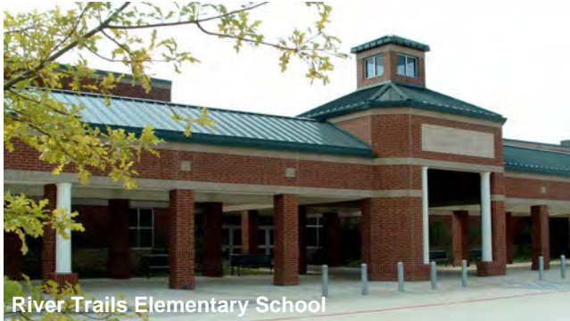
River Trails Elementary School

River Trails Elementary School , HEB ISD, Hurst, Eules, Bedford, TX • $7,000,000.00 project cost