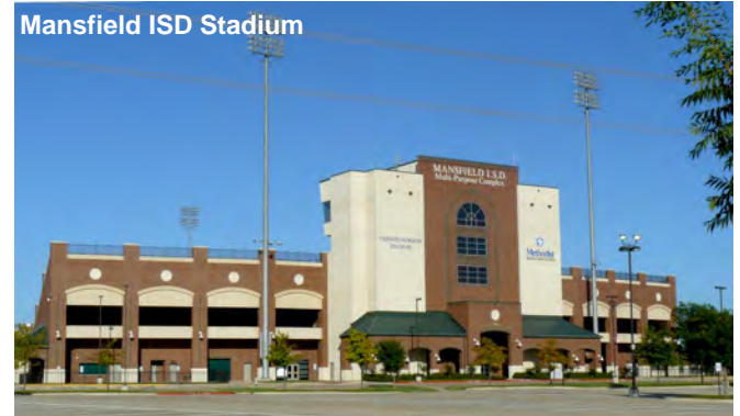
Mansfield ISD Stadium

Mansfield ISD Natatorium , Mansfield ISD, Mansfield, TX