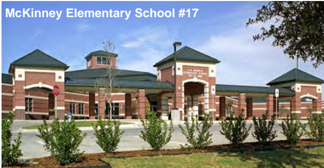
McKinney Elementary School #17

Lizzie Nell Cundiff McClure Elementary School , McKinney ISD, McKinney, TX • $15,000,000.00 project cost