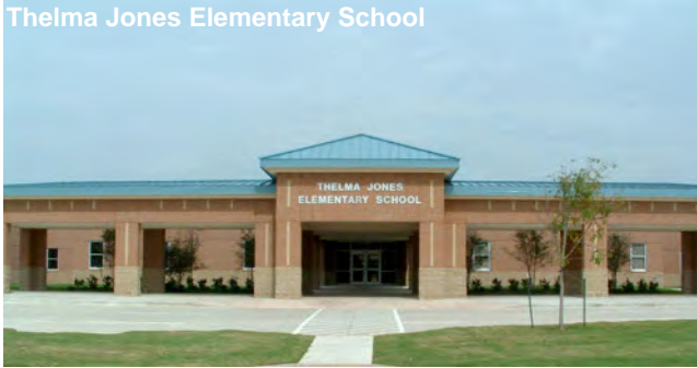
Thelma Jones Elementary School

Roberta Tipps Elementary School , Mansfield ISD, Mansfield, TX