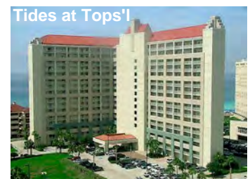
Tides at Tops'l