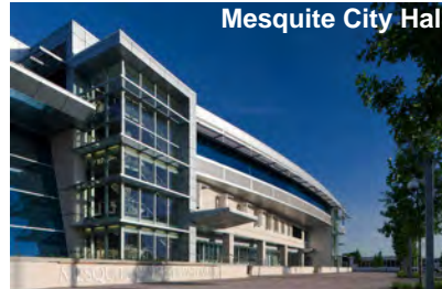
Mesquite City Hall