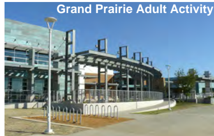
Grand Prairie Adult Activity Center, Grand Prairie, TX