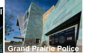
Grand Prairie Police