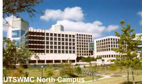
UTSWMC North Campus