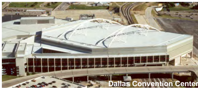
Dallas Convention Center