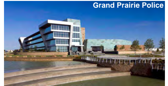
Grand Prairie Police