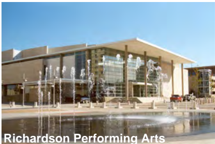
Richardson Performing Arts